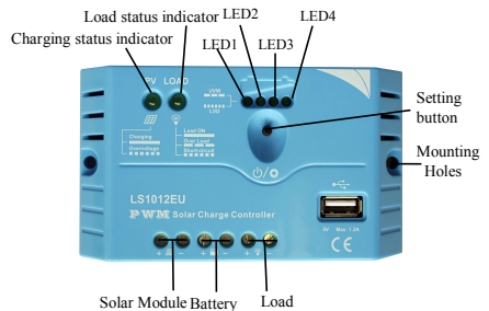
Terminals Terminals Terminals